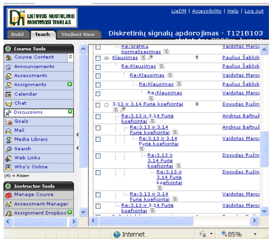
Fig. 2. The example of thread in one of discussion forums

DTSP course is structured in the “theme format”. The themes have lecture slides in pdf format, descriptions of lab works and homework projects in MS Word format, dedicated discussion “Forums” and “Assignment” tools with possibility for students to upload electronic reports.