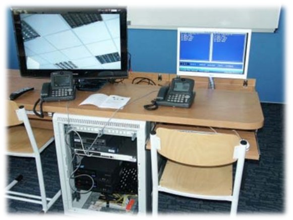
Fig. 1. Analysis of IP-based multimedia services

We must not forget about IPTV that also serves for distribution of digital television. The exercise consists in analysis of captured data packets during operation (see illustration in Fig. 1).