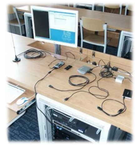
Fig. 2. Devices for data transmission in mobile networks

Students can setup the system and its parameters, and also analyze the data signal in time and frequency domains. Then they can evaluate the behaviour of multimedia services (such as VoIP or IP videotelephony) in different configurations using subjective tests and objective measurements.