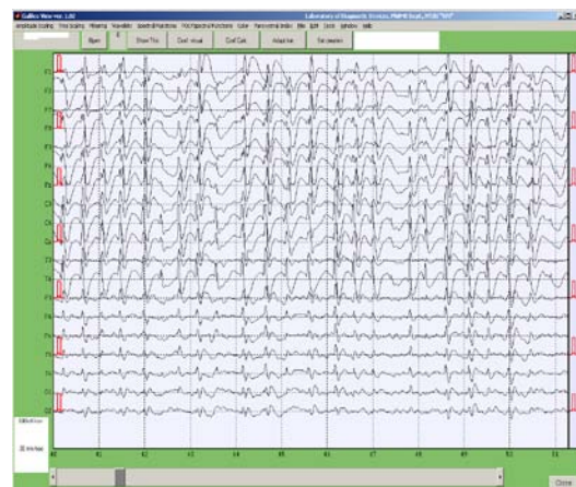
Fig. 1. Example of the electroencephalogram of the epileptic brain

evolution and behaviour of signal can be tracked in the wavelet-spectral domain.