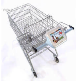
Fig. 1. The shopping basket equipped with the RFID reader