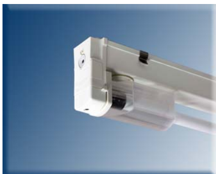
Fig. 1. Luminaire housing with lamp cover and heat accumulation tube

The photo shows a luminaire with an open section, with at least one fluorescent lamp, with a socket on the end side, a diffuser which encloses the fluorescent lamp and which is held in the end parts, as well as a protecting tube, made of a translucent material. The protecting tube is shaped on both ends over the adapter bushings, which function as heat accumulator, and which hold the heat accumulation tube, and which internal space is connected, through the end parts, with a limited internal space of the diffuser, of the heat accumulation tube and of the end parts, and as such facilitate an air exchange. Very recognisable is the adapter bushing with the heat accumulation tube in the diffuser. The cross-section of the diffuser can be shaped freely.