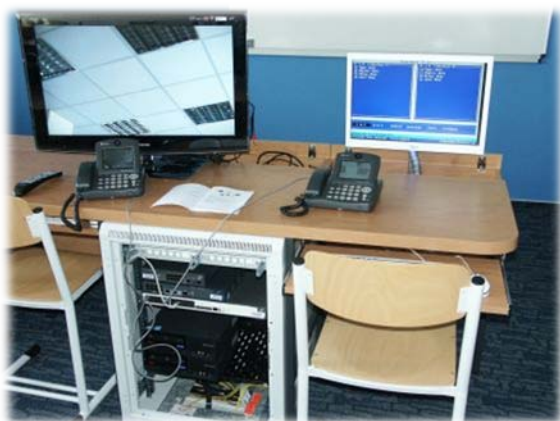
Fig. 1. Analysis of IP-based multimedia services

We must not forget about IPTV that also serves for distribution of digital television. The exercise consists in analysis of captured data packets during operation (see illustration in Fig. 1).