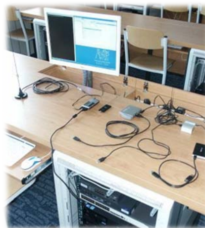
Fig. 2. Devices for data transmission in mobile networks

Students can setup the system and its parameters, and also analyze the data signal in time and frequency domains. Then they can evaluate the behaviour of multimedia services (such as VoIP or IP videotelephony) in different configurations using subjective tests and objective measurements.