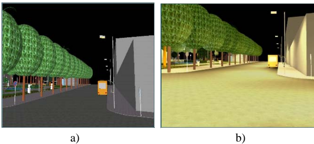
Fig. 3. Simulation of Avenida Sá da Bandeira (bottom) – Dialux daytime/nighttime images