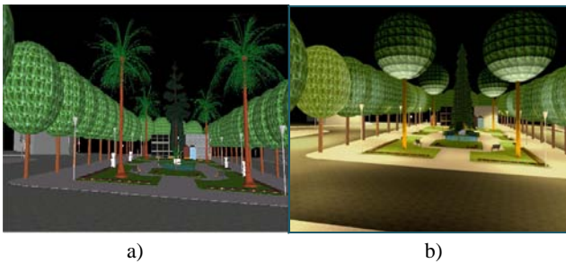
Fig. 2. Simulation of Avenida Sá da Bandeira (top) – Dialux daytime/nighttime images