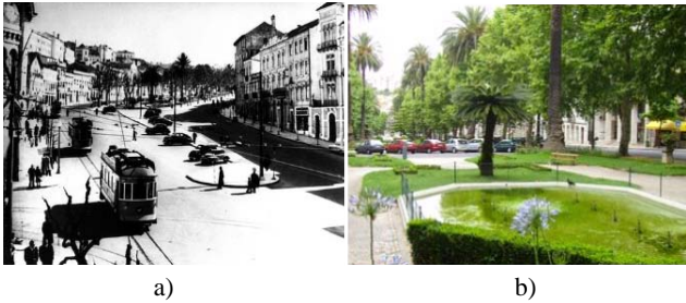
Fig. 1. Photos of Avenida Sá da Bandeira and central garden

kind of public promenade, thereby connecting the lower area, D. Luís square (today called Praça da República) and the University of Coimbra. The central garden was designed in 1928. The Lighting project of Avenida Sá da Bandeira in Coimbra is part of a study of the redevelopment of important areas of the city. The project was to study the area in order to learn about the lighting system currently used as well as the historical and architectural places of interest that need to be enhanced with adequate lighting [18–23].