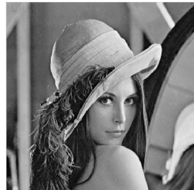
Fig. 3. Restored image. PSNR=50

Experiment #2. Attacked Lena from Experiment #1 was additionally blurred.