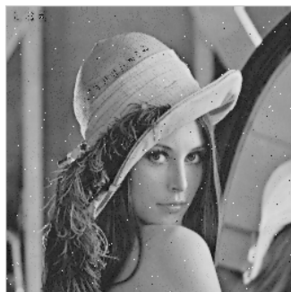
Fig. 5. Restored image after #2 iteration

The white pixels in Fig.5 is the result of mistakes in Reed-Solomon error detection codec. The rate of the mistakes is about 1%.