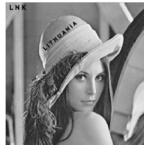
Fig. 1. Attacked Lena

Experiment #1. Attacked Lena (“LNK” and “LITHUANIA”).