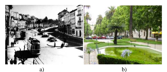
Fig. 1. Photos of Avenida Sá da Bandeira and central garden

kind of public promenade, thereby connecting the lower area, D. Luís square (today called Praça da República) and the University of Coimbra. The central garden was designed in 1928. The Lighting project of Avenida Sá da Bandeira in Coimbra is part of a study of the redevelopment of important areas of the city. The project was to study the area in order to learn about the lighting system currently used as well as the historical and architectural places of interest that need to be enhanced with adequate lighting [18–23].