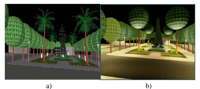
Fig. 2. Simulation of Avenida Sá da Bandeira (top) – Dialux daytime/nighttime images