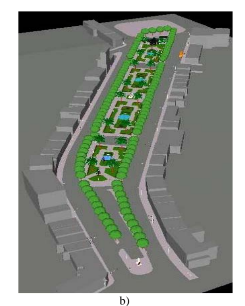
Fig. 4. Simulation of Avenida Sá da Bandeira (top view) – Dialux daytime/nighttime images