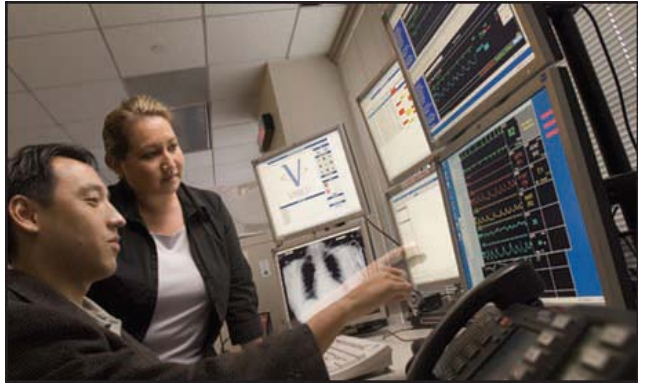
Fig. 1. Centre of a health network "fibre to the home"

These new information and communication technologies in medicine create new problems. MedIS, like other IT-systems, are vulnerable to malware attacks. Data protection, confidentiality and computer security are basic requirements for the appropriate introduction and use of information and communication technologies in health care. The basic technical challenge is the openness of modern data processing and communication systems. There is virtually no paper on medical data processing that doesn't mention the need of data protection. But with new technologies the situation becomes even worse, as they change the way medical data have to be protected.