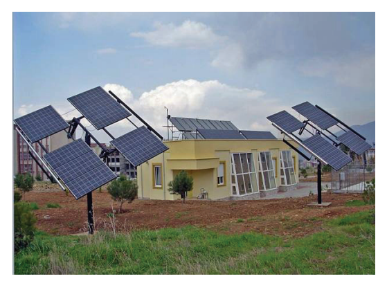
Fig. 1. Clean energy house

One of the integrated renewable - fuel cell energy systems combined solar and wind energies as primary energy sources was installed on the campus of Pamukkale University in Denizli, Turkey (Fig. 1) as a CEH center.