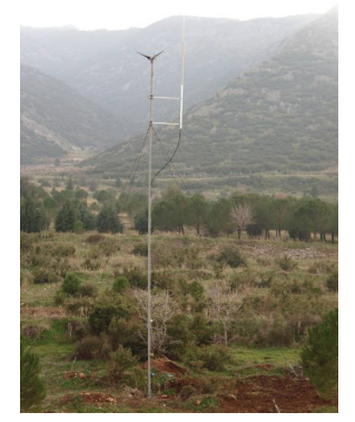
Fig. 6. Wind turbine with HVI air termination rod

All conductors in the lightning protection system were contacted with the equipotential bonding that is outside of the building. For preventing the hybrid energy system from the surge coming from the national grid, a surge arrester was set up to the entrance of the line (Fig. 7). Electrical installation of CEH is 3-phase TT-system. In 3phase TT-system, protection conductors of devices are separated from 3-phase energy source. Thus, a surge arrester was chosen for 3-phase TT-system.