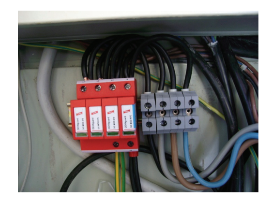
Fig. 7. 3-phase surge arrester

All conductors in the lightning protection system were contacted with the equipotential bonding that is outside of the building. For preventing the hybrid energy system from the surge coming from the national grid, a surge arrester was set up to the entrance of the line (Fig. 7). Electrical installation of CEH is 3-phase TT-system. In 3phase TT-system, protection conductors of devices are separated from 3-phase energy source. Thus, a surge arrester was chosen for 3-phase TT-system.