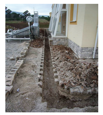
Fig. 3. Digging work for the round grounding

As seen in Fig. 2, there are an equipotential bonding bar and six down conductors on the building. Minimum number of down conductors (n) is calculated as [14]