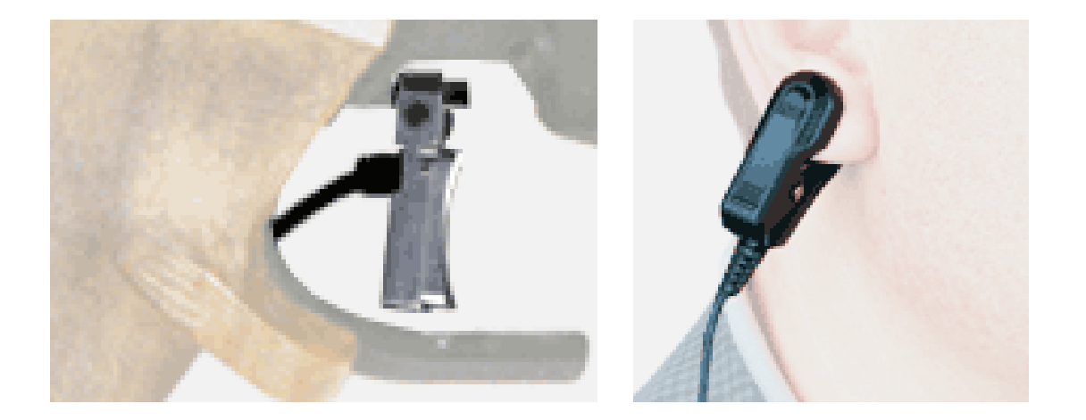
Fig. 3. Trigger pushing and pulse sensors

In shooting training also is important discovered the shooters physical factors – breezing, pulse and level of biological tremor. For this purpose some simulators contain a special shooters conditions sensor. For example Russian simulator SCATT Professional pull together at least two tips of these sensors [6] (see Fig. 3).