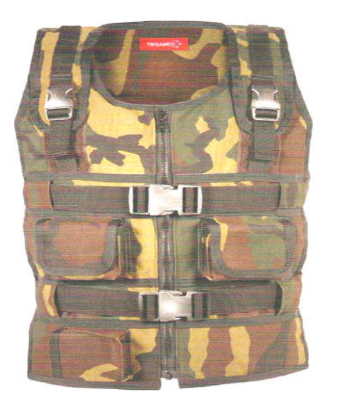
Fig. 4. Patented Impact Generating Technology 3rd Space Vest

The lasers simulating the shot are used on the weapons to simulate ballistic characteristics of live-fire weapons. Multiple Integrated laser Engagement System (MILES) [8] is the most frequently used laser training system, which is dealing with laser diode technology. The MILES training system provides a realistic battlefield environment for soldiers involved in training exercises. MILES provides tactical engagement simulation for direct fire force-on-force training using eye safe laser "bullets". Each individual and vehicle in the training exercise has a detection system to sense hits and perform casualty assessment. Laser transmitters are attached to each individual and vehicle weapon system and accurately replicate actual ranges and lethality of the specified weapon systems.