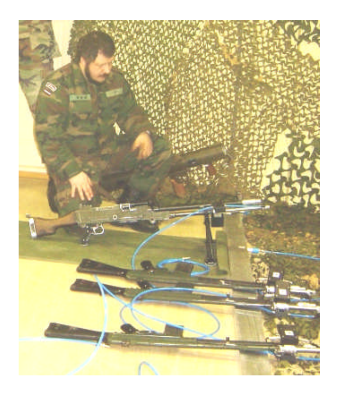
Fig. 5. Shooting simulator SAIKU-8

Ministry of Defense of Latvia was ordered shooting simulator for recruits and solders group training and marksmanship skills in 2004. The shooting simulator SAIKU-8 [9] had been presented after 9 months. The basic model supports 8 shooting places.